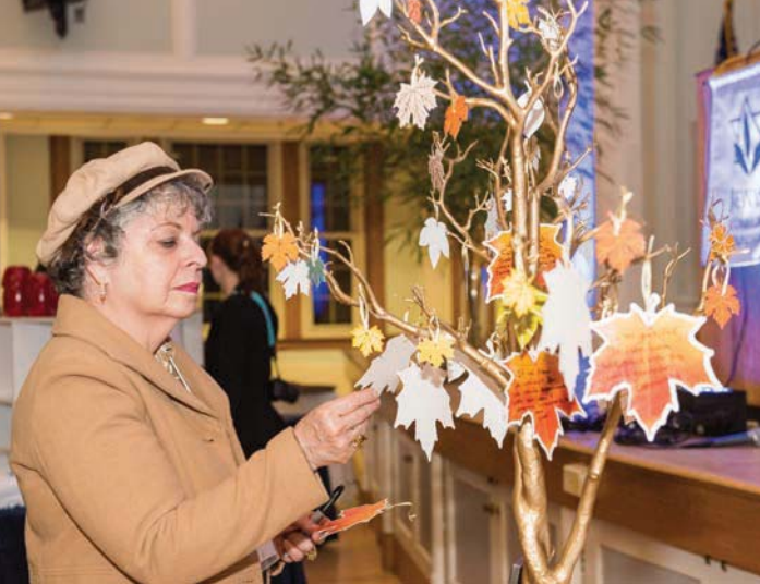
Donor Reception Guests shared messages of gratitude to create a gratitude tree at the Foundation's 2017 Donor Reception.